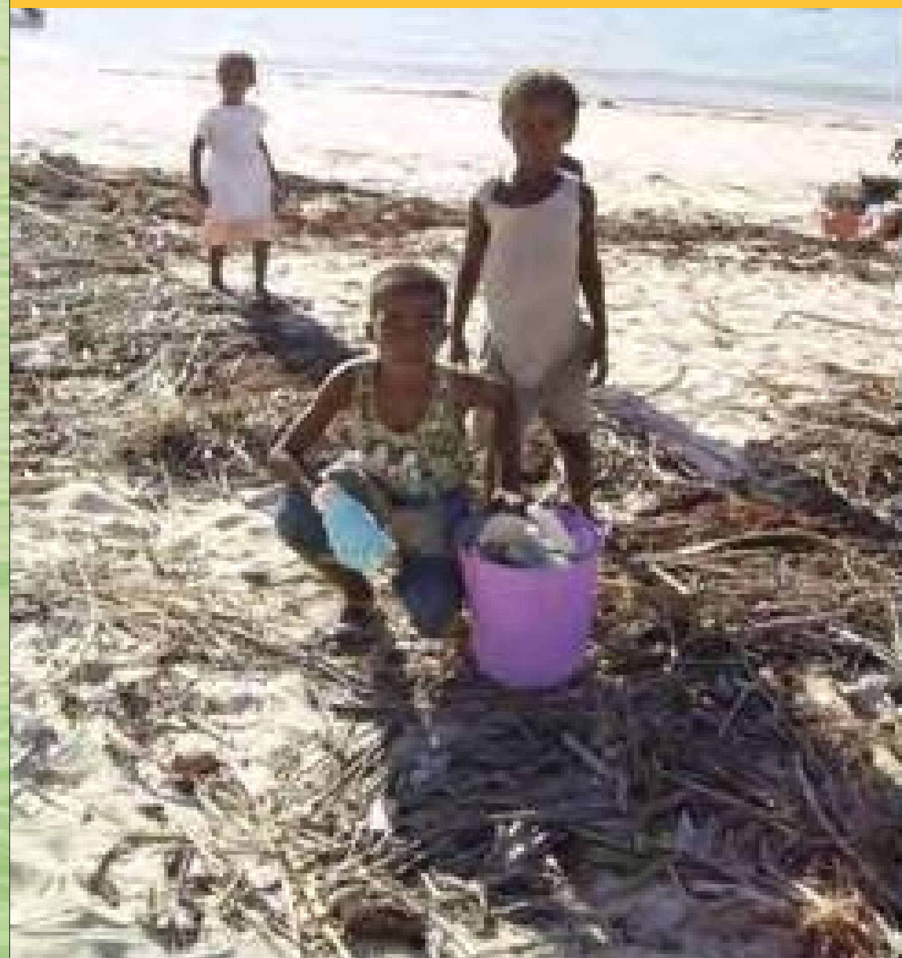
Contact: Alasdair Harris, Blue Ventures at @blueventures.org www.andavadoaka.org