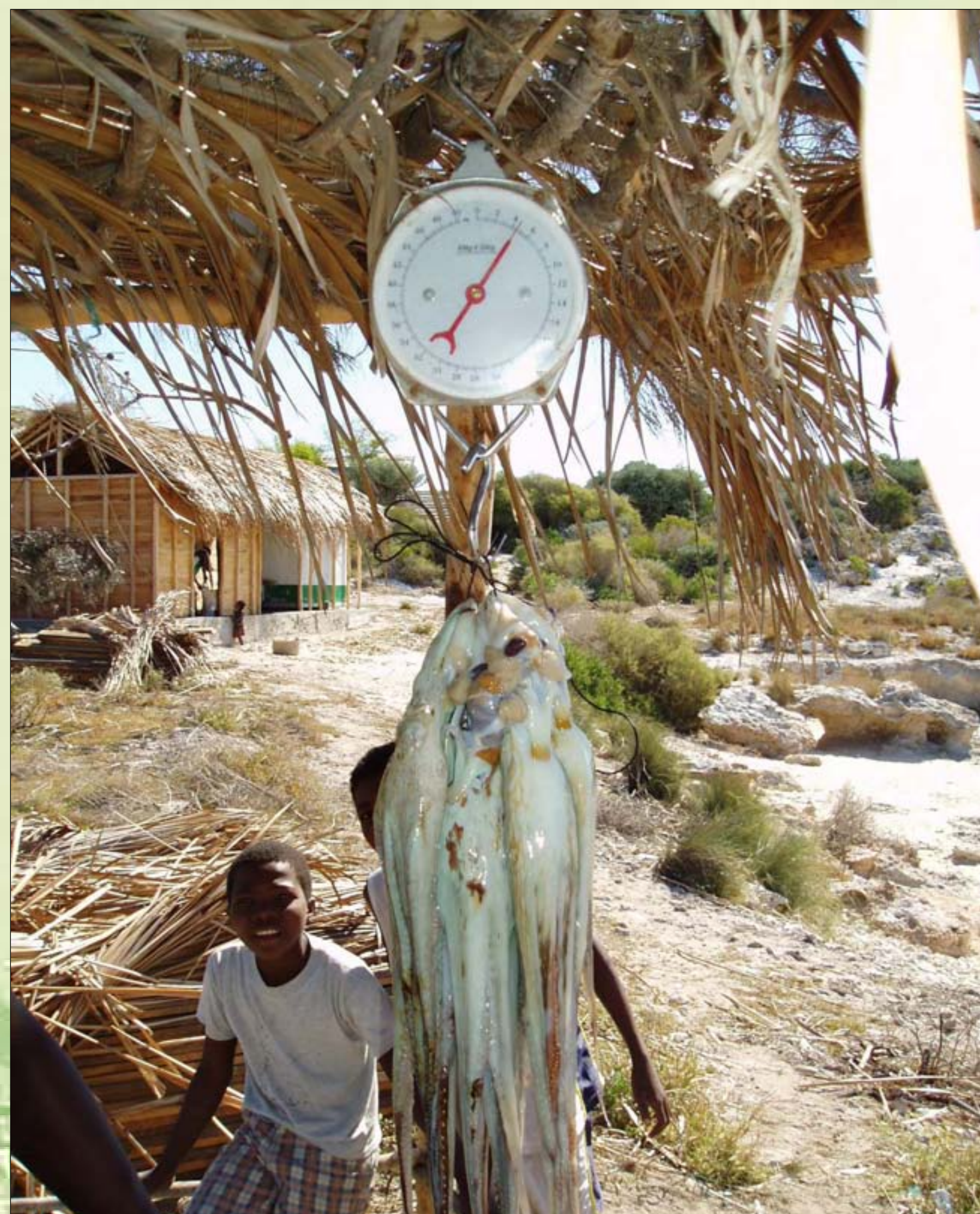
"The Andavadoaka project shows MPAs (marine protected areas) not only serve as a powerful conservation tool helping species thrive, but can also be a powerful economic tool helping fisheries remain productive and profitable" Alasdair Harris, Blue Ventures

Good governance is about how decisions are taken and implemented in a state. Originally, the connotations of this notion included an efficient public sector, accountability and controls, but also decentralization and transparency. Today, good governance means more: It is not just confined to government action alone but also encompasses the interaction between government and civil society.