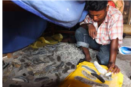
Sea cucumber processing

The project is pertinent to the overall objectives of ReCoMaP: to enhance sustainable management and conservation of coastal and marine resources. This project aims to alleviate poverty in coastal populations through close collaboration with the Velondriake Association to strengthen the capacity of local communities to achieve sustainable integrated coastal zone management.