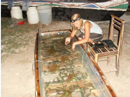
Sea cucumbers in pens on land before deployment to villages

with the technical capacity and means to carry out Holothurian mariculture. The project will finance the 'start-up' materials for a total of 4 pens per family group which will remain the property of each family. It will also provide the juveniles to stock these pens on the condition that the families re-pay the 'delivered' price of the juveniles when the market-sized sea cucumbers are sold.