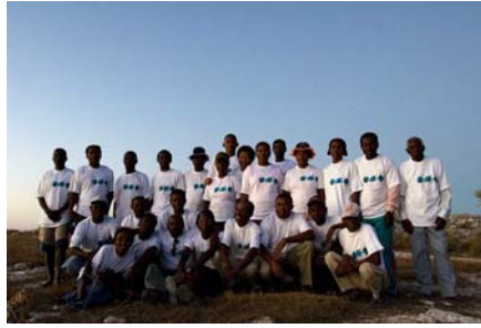
The Velondriake Committee

their villages to teach their respective communities what they had learned during the workshop and to decide which aspects of the workshop's proposals would be implemented. BV also visited each village, holding village meetings with the Velondriake Committee member to ensure that there was a full understanding of the NTZs and what had been covered during the workshop.