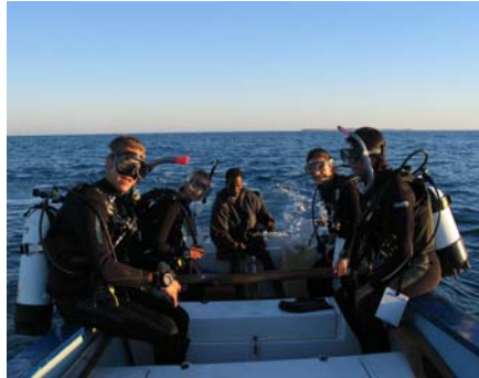
Blue Ventures dive team

developed by IHSM for the PACP project which combined Line-Intercept Transects and 1m 2 quadrats to detail the main benthic life forms and 100m transects for fish biomass. On the reef flats, the benthic methodology was conducted by snorkelling. Deeper patch reef sites were also surveyed for incorporation into the reserve, as this is where female octopus would take refuge during the spawning period.