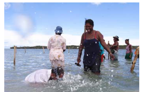
Women helping BV staff construct sea cucumber farming pens

The financing from ReCoMaP will enable Blue Ventures and the Velondriake Association to link individual family groups to the commercial supplier/buyer, transfer the technology for holothurian farming, define models for ownership and train families to run a profitable and sustainable business.