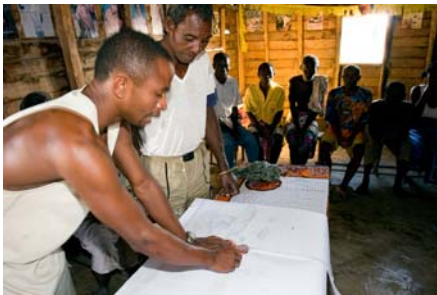
BV Staff working with the Committee to select NTZs

Suggestions made by the committee to overcome earlier problems included fixing a single opening date for all NTZs, to remove problems of convergence and 'free-riding' by itinerant fishers on the day of each NTZ reopening; stopping octopus fishing during the neap tides and working with collectors to enforce this; and implementing permanently rotating reserves, whereby as soon as one closed area is reopened, a nearby NTZ of similar size is closed.