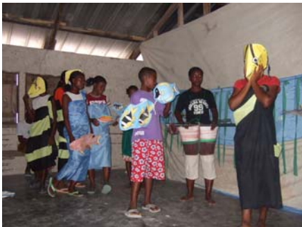
Club Alo Alo performing in Lamboara

Club Alo Alo in Andavadoaka has been a great success, with kids getting involved and helping to bring education to the whole community. In September 2007 the Club organised an educational play that was designed to inform the community about the delicate balance in their local environment.