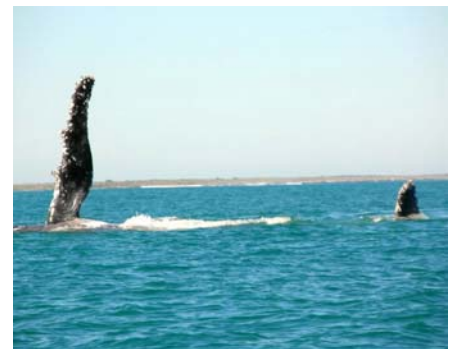
Humpback whale breaching

At the culmination of the 2007 survey season Blue Ventures staff and volunteers had witnessed 130 humpback whales ( Megaptera novaeangliae ) travelling through the region from the purpose built whale watching platform on the offshore barrier island of Nosy Hao.