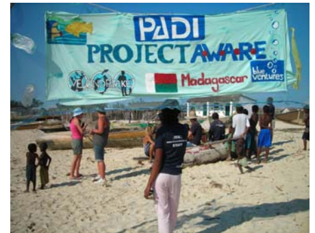
Banner promoting the clean up day on Andavadoaka beach

On Sunday 21st September 2008 a team of Blue Ventures staff and volunteers set off on a clean up dive to an isolated patch reef named Recruitment. Armed with mesh bags and gloves the divers collected all the marine litter they could find on the reef. A successful dive left the reef pristine, and free from manmade debris.