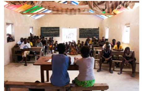
BV Staff chairing a Velondriake meeting

On 14 th March 2008 the Velondriake Committee and Blue Ventures (BV) held a workshop on octopus fishery management in Andava-doaka to overcome any short fallings of the 2007 closures and to repeat its successes.