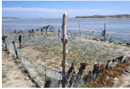
Sea cucumber farming pen

of Velondriake to act as an independent community organisation to administer and manage its own projects and innovate microenterprise developments.