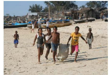
Andavadoaka kids racing along the beach with a full sack of rubbish

The main event of the day was a large scale beach clean up. This had been carefully planned to ensure maximum village involvement, and BV volunteers designed a banner to increase awareness of the aims of the day. Children from Andavadoaka were recruited to help the staff and volunteers with the daunting task of clearing Andavadoaka Beach of all litter.