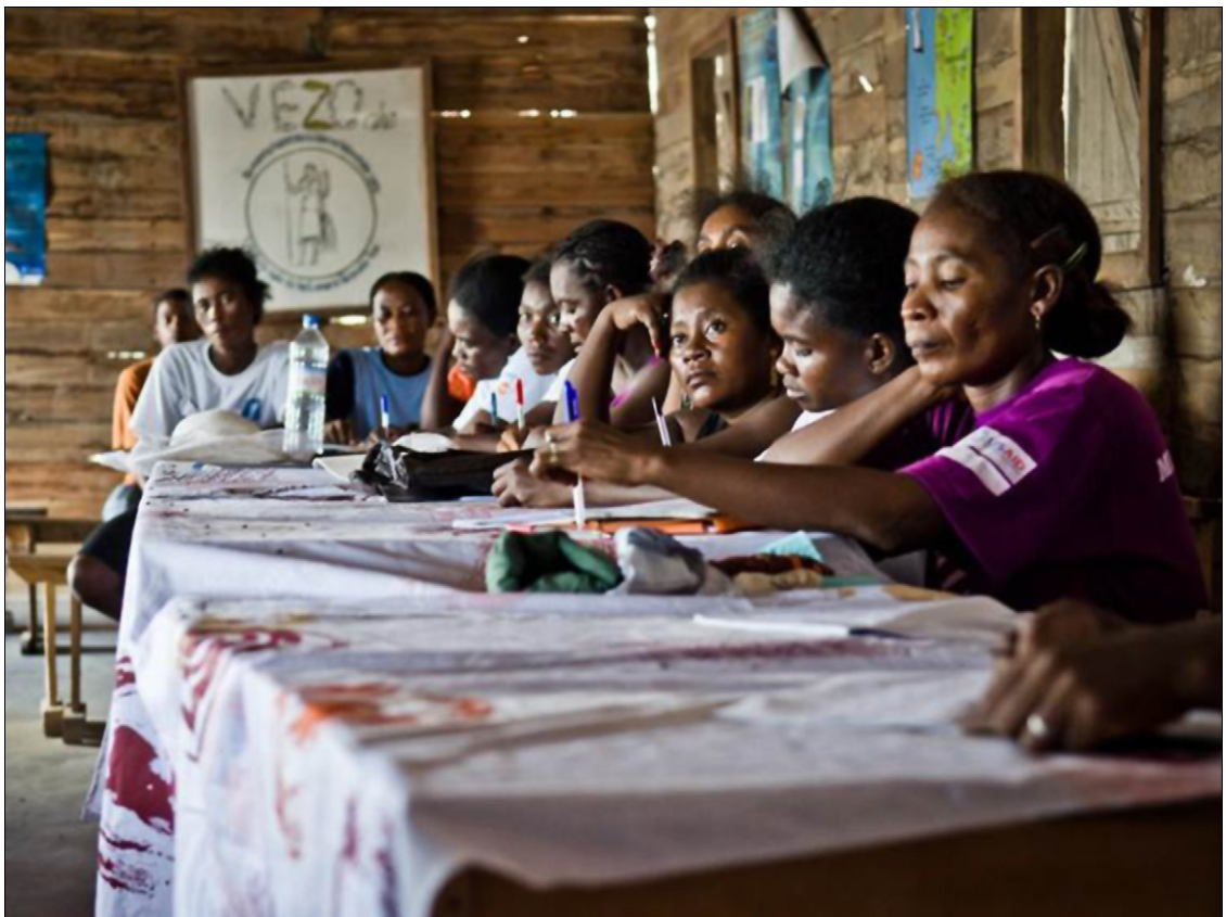
Training session for community-based distributors

In 2009, against the backdrop of the political crisis and in spite of the more challenging working conditions that ensued, a dedicated Safidy clinician was recruited, initially a local clinical technician practising under the supervision of the Blue Ventures health professional. In 2013 she moved to work with the Blue Ventures fisheries team and was replaced by a midwife. The family planning service was gradually expanded from 2009 to 2011 to include outreach clinics in nine villages within the Velondriake LMMA, with Blue Ventures staff travelling by boat or oxcart to deliver services in these villages. In order to