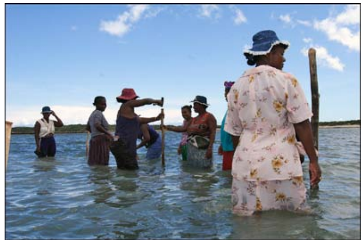
Figure 5. The Women's Association of Andavadoaka building their first pen.