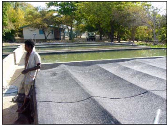
Figure 3. The sea cucumber nursery at Belaza, southwest Madagascar.