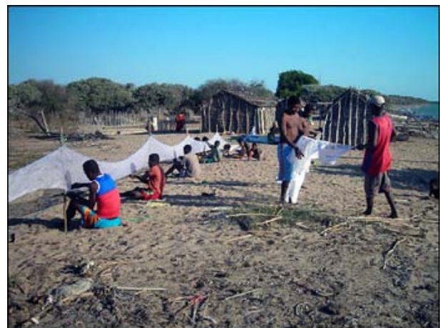
Figure 7. Families in Ambolimoke preparing nets and building their pens.