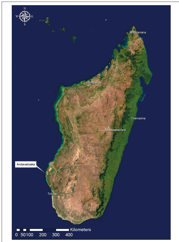
FIGURE 1. Location of the Andavadoaka region, southwest Madagascar.

2000). Limited employment opportunities, combined with low agricultural productivity, resulted in a five-fold increase in the fishing population in a period of 17 years leading up to the early 1990ties, causing an overexploitation of marine resources, especially near urban centres such as Toliara (Gabri  et al. 2000). Laroche et al. (1997) provide evidence that over-fishing in the Toliara region has led fishers to target lower value fish in an effort to sustain yields in the face of reduced stocks of large piscivorous species. At the beginning of the new century, over 50% of the artisanal fishing in Madagascar was estimated to occur along the reef systems of the southwest (Cooke et al. 2000). The village of Andavadoaka, at the geographical centre of this project area, has seen a doubling of population input rate (births and immigration arrivals per year) in the 10 years leading up to 2003, with over 50% of the population being aged 14 or under. Fishing is the primary economic activity for 71% of villagers (Langley et al. 2006).