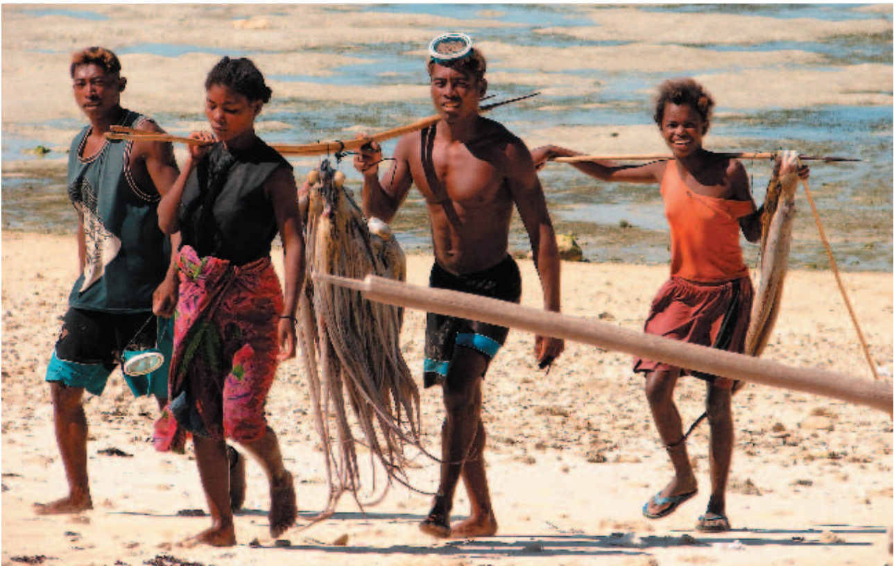
FIGURE 4. Fishers landing catch of Octopus cyanea following reopening of Nosy Fasy no take zone, 2006.

only extractive options for resource utilisation. With a growing market of tourists arriving in Andavadoaka the potential exists to incorporate local villagers into this expanding service industry and for local communities to obtain substantial economic gain in doing so. By demonstrating to local villages that coral reef and other marine and terrestrial resources can be used to generate income from non-extractive activities, whilst also simultaneously achieving conservation and fishery benefits, protected areas have the potential to provide a greater appreciation for, and understanding of, natural resources within the region. The need to develop Velondriake's capacity to receive, host and guide ecotourists has led to the development of a community eco-guide training programme, and plans for construction of a community-run eco-lodge, which will be fully owned and managed by the village of Andavadoaka, and occupied in part by visitors brought to the region by Blue Ventures' existing ecotourism programmes, which currently account for over 7,000 tourist-nights to the village each year.