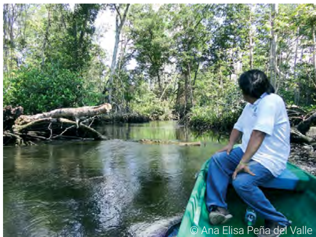
© Ana Elisa Peña del Valle