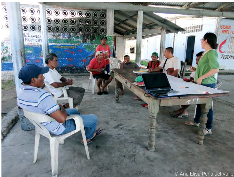
© Ana Elisa Peña del Valle

In order for problems of salinity to be solved in perturbed mangrove ecosystems, as well as for fish production and migration to be optimised, it is vital that channels within the mangrove systems are properly cleared and maintained, even if this means cutting some trees. Clear and well-maintained channels permit the hydrological flows between salt- and freshwater sources in a mangrove to find a natural balance, favouring biodiversity. They also permit the movement of fish to and from the ecosystem in rhythm to those flows, as well as facilitating the natural expansion of the mangroves via greater seed dispersal