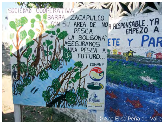
© Ana Elisa Peña del Valle