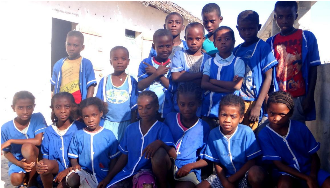
Class 11 and 10eme