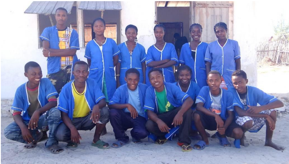
Class 4eme 2010 - 2011

“My personal goal is to help my village to develop. There are not a lot of people who have the opportunity to study. I feel it is my duty to apply my education into helping to improve things here in my village - there is no better way for me to use my education. Thank you Blue Ventures for all the support you’ve given me.”