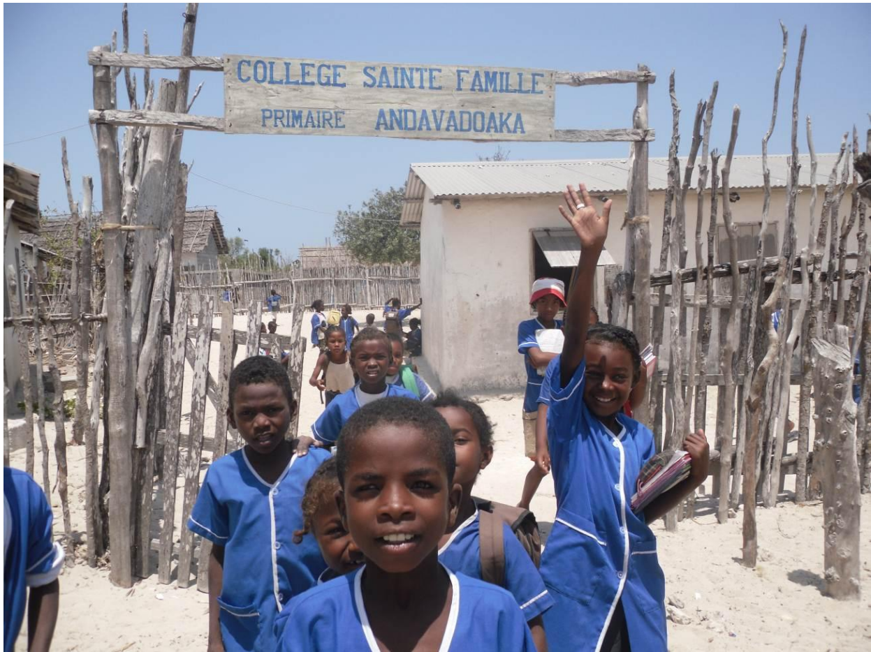
2010 - 2011 Blue Ventures' scholarship recipients, Andavadoaka